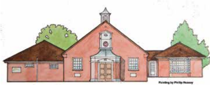
Reg Charity: 300309