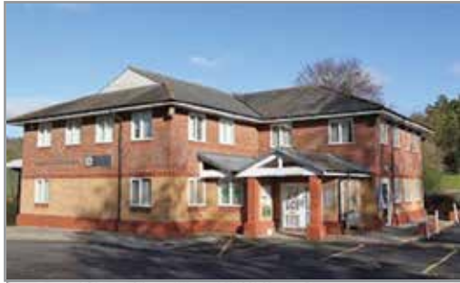
Hughenden Valley Surgery

Firstly we'd like to say a huge thank you to all our patients for their support and patience during our IT changeover.